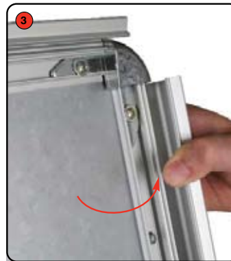
3 Open out the spring loaded frame sides