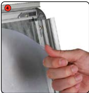
4 Remove the clear protective sheet