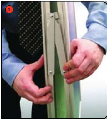
1 Open out the A-sign frame to form a stable shape