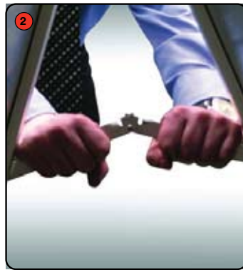
2 Push down on the central locking bars