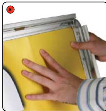
5 Place the graphic into the frame