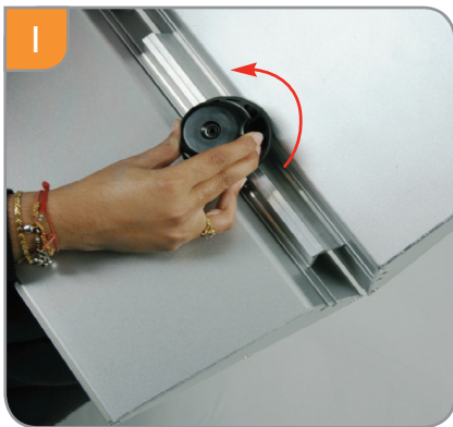
1 Loosen the thumbwheel screws located on the rear of the base.