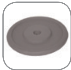
Extra weight for dome base (weight 9kg approx)