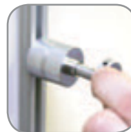
Unscrew and remove the standoff cap.