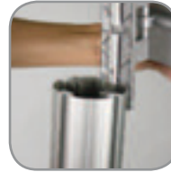
Slide the LCD bracket into the channel. Move to the required position.