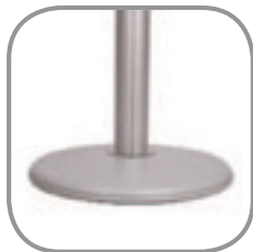
450mm dia Steel dome (weight 7.5kg approx)