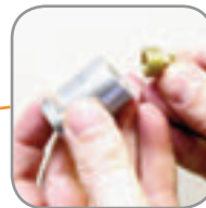
Screw the brass rail insert into the standoff.