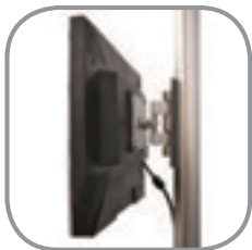
Small LCD bracket