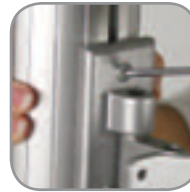
Once in position, tighten the bracket onto the linear post.