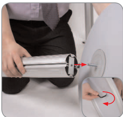
Attach base to male post using M10 bolt and allen key. Ensure clear washer is between base & post.