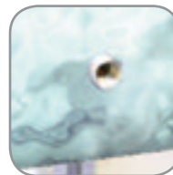
Align the drilled holes in the substrate over the standoff.