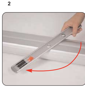
Twist out the stabilising foot from the base. Turn unit over.