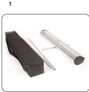
Kit: Hybrid Pole, Base, Cassette and Carry bag